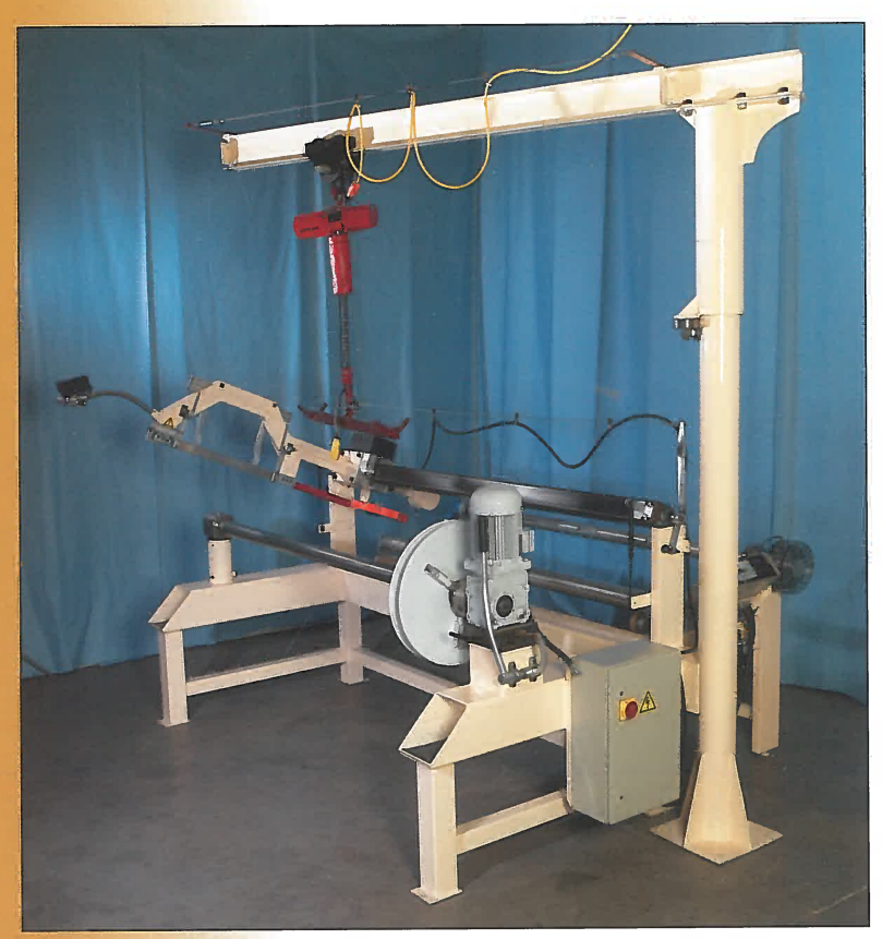
CollinsCraft Roll Slitter Model 76-24 with jib crane hoist and re-roller attachments pictured are offered as options.