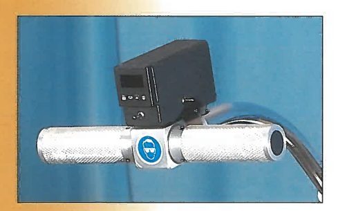
Cut widths may be programmed in either metric or English measurements. Slitter controls are easy to use and within reach of the operator. The standard slitter is manually positioned to the cut width. Options include Auto-stop and Auto-index.

Adjustable roll speed and stationary blade prevent friction heat buildup.