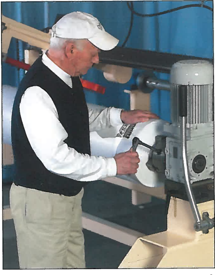
Every CollinsCraft Roll Slitter is manufactured for safety. Each machine is equipped with manual blade guards.

Everyday CollinsCraft Roll Slitters cut... Non-woven, Woven, Geotextiles, Garment, Home Furnishings, Leather, Ceramic, Rubber, Fiberglass, Carpet, even Ballistics Grade Woven Kevlar™.