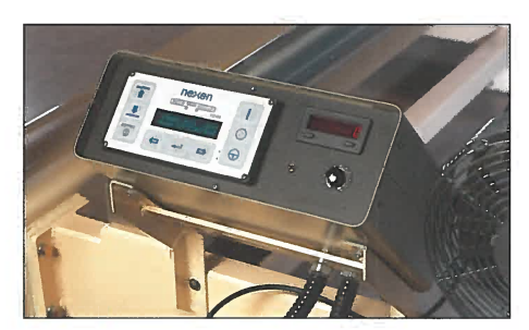
CollinsCraft designed Re-rollers are available as an option. This adds utility and flexibility to the slitter.