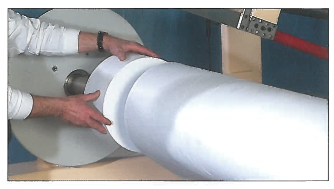
Every cut is neat, clean and to the exact measurement. Blade life is lengthened because it stops short of the non-rotating mandrel.

Adjustable roll speed and stationary blade prevent friction heat buildup.